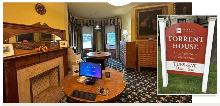
HPL's Local History & Genealogy Department offers extensive resources for researching community and local history, discovering family roots and ancestry, and so much more.

Did you know our Local History & Genealogy Department has a complete collection of all known Muskegon City Directories? More than just phone books, city directories are vital resources for researching family, business, and property histories. Looking up a name can give you a person's occupation, the length of time they've resided at that address, and sometimes even the value of the property! Later directories provide even more useful information, including a section